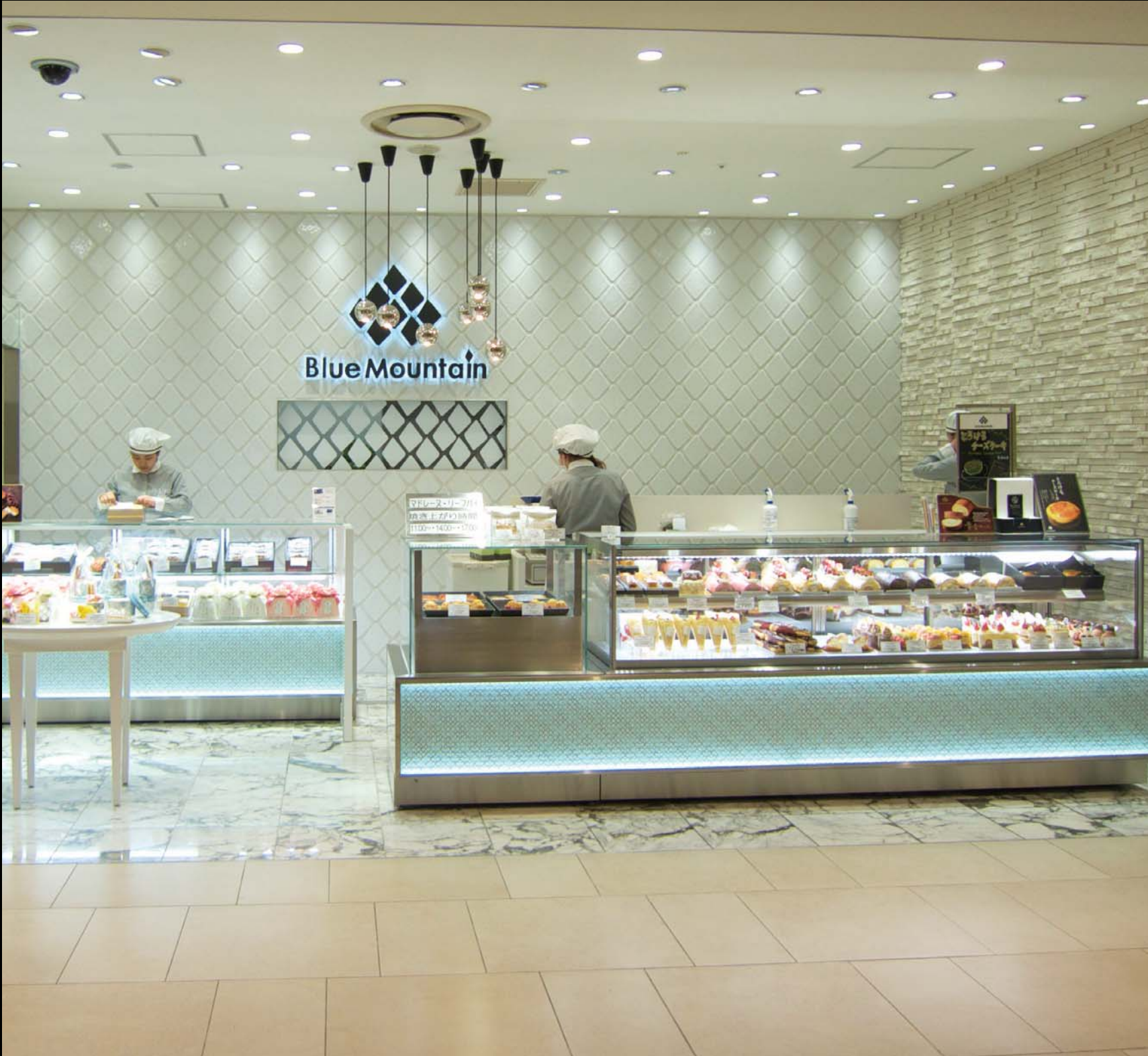
JR Osaka station department