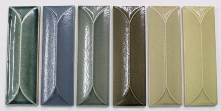
Wet press molding, the color of the glaze can also be specially ordered.