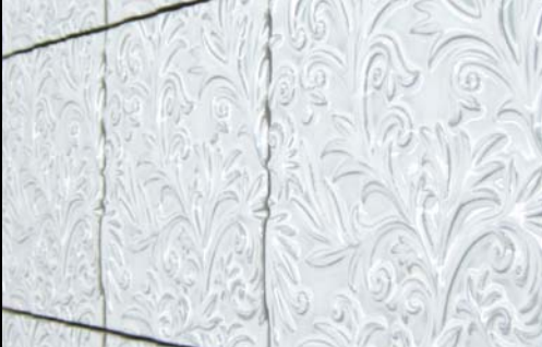
Mold casting + Firing in glossy white glaze