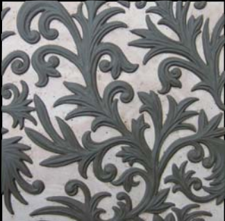
Prototype by the clay 150×150mm