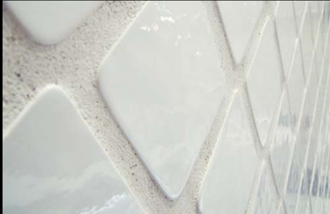
Rhombus rough surfaces by mold casting. 200×160×13mm