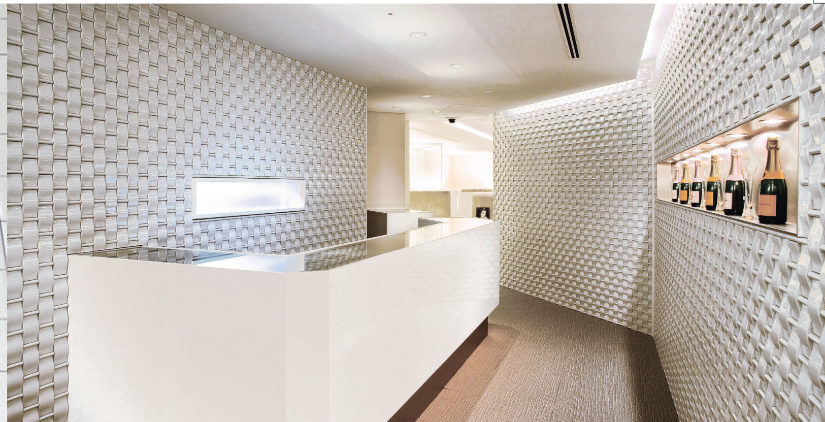
SHINJYUKU PICCADILLY andesign THT-61 THA-11